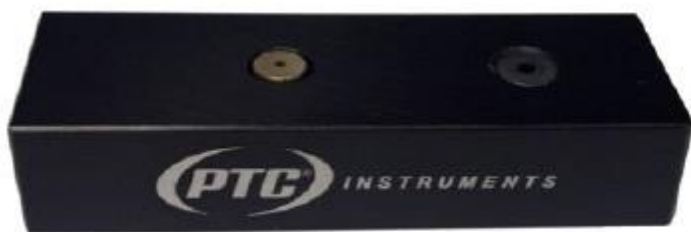
Aluminum Test Block

Other durometer types, custom models and durometers from other manufacturers can also be certified by PTC Metrology™.