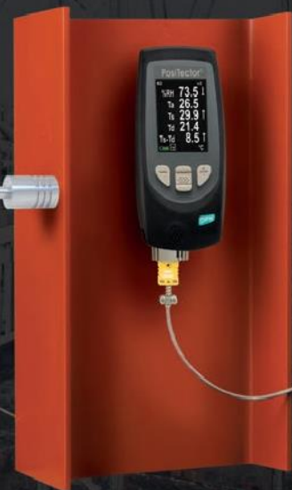
Select from 5 probe models