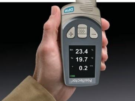
Flip Display enables right-side-up viewing in any position. PosiTector DPM A shown.