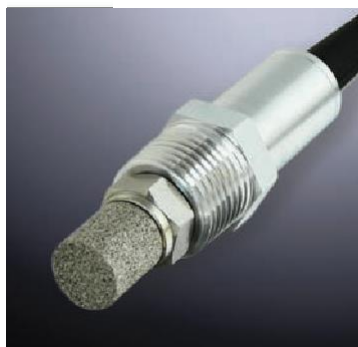
PosiTector DPM D includes 1/2" NPT threads for insertion into pipes (max 200 psi).