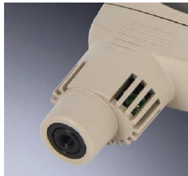
PosiTector DPM IR probe includes a non-contact infrared surface temperature sensor.