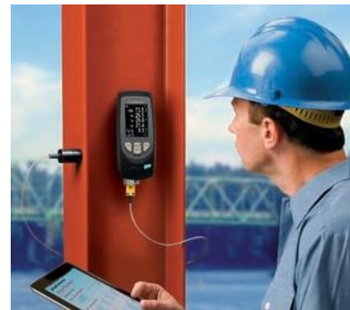
Analyze Readings using a web browser from anywhere – jobsite or head office.